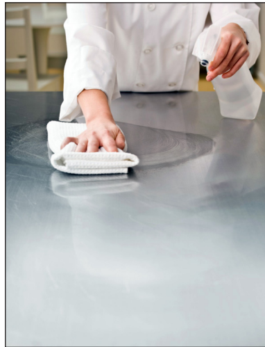
Suitable for Tables - Cleans and sanitises surfaces