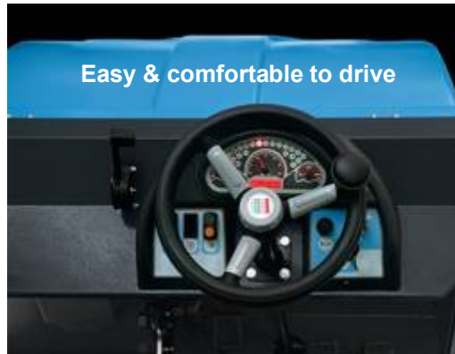
Easy & comfortable to drive