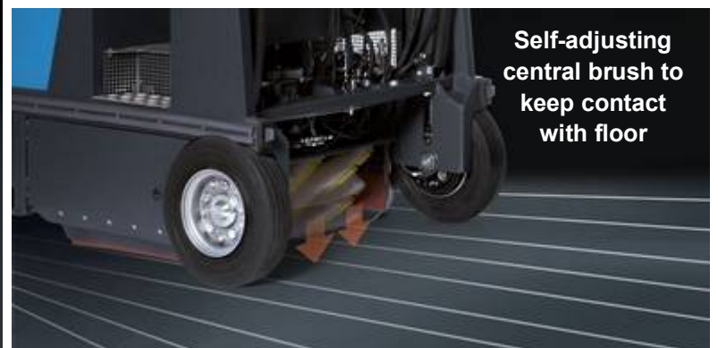
Self-adjusting central brush to keep contact with floor