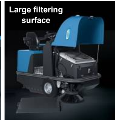
Large filtering surface