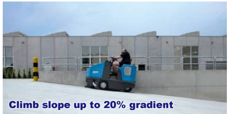
Climb slope up to 20% gradient

Protect machine from bumping and improve manoeuvrability.