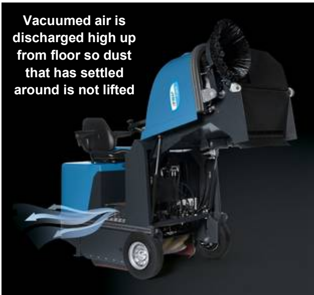
Vacuumed air is discharged high up from floor so dust that has settled around is not lifted