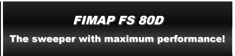
FIMAP FS 80D The sweeper with maximum performance!