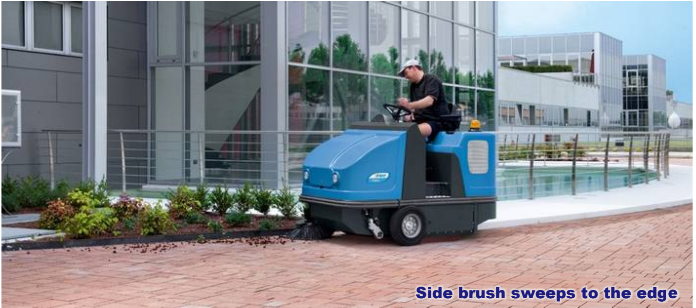
Side brush sweeps to the edge