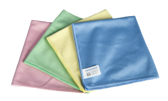
Ultra88 - Miracle Microfiber Cloth