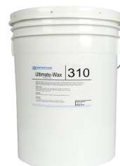
Ultimate Wax (310)