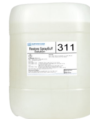
Restore SprayBuff (311)