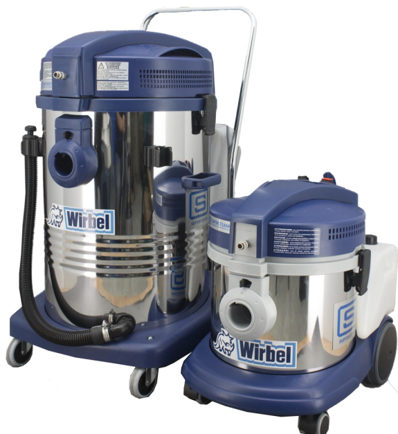
Maxi CE 56 / 2