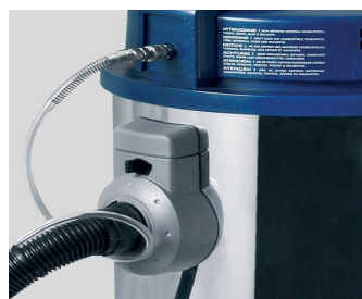
Variety of accessories